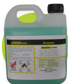
Degreasing cleaning product - Ref 140090

In order to eliminate any air bubbles under the adhesive, we recommend rolling something heavy on your track, such as a forklift truck, for a perfect grip on the ground.